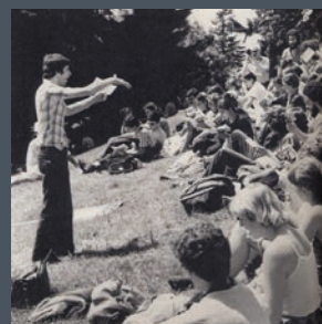
First founders: Choral organization „A Coeur Joie“ (France) and choral organization „Arbeitskreis Musik in der Jugend“ (Germany).