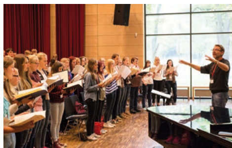
Festival di Primavera