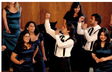
European Youth Choir Festival