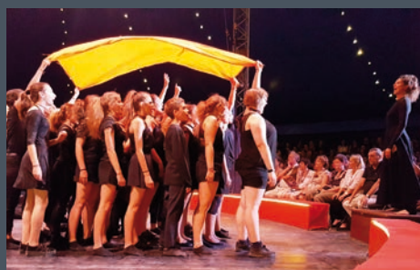
EC Junior 2017