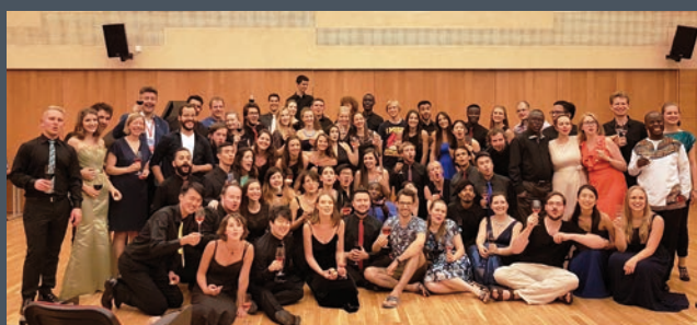
World Youth Choir 2017