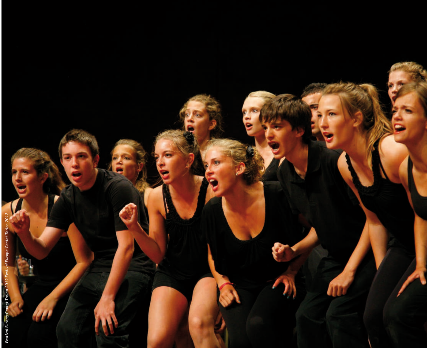
Festival Europa Cantat Torino 2012 Festival Europa Cantat Torino 2012