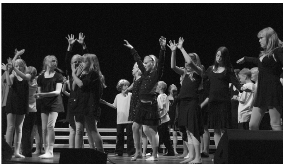
At the Hearts-in-Harmony concert in Trondheim, Norway, in 2008

With Hearts-in-Harmony Europa Cantat and the choral world are hoping to contribute to a better inclusion of handicapped singers, not only during the EU Year for Combating Poverty and Social Exclusion but well beyond.